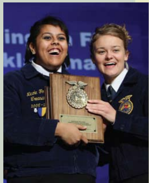
FFA—Can You Feel It?